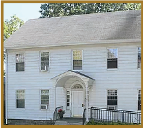
Elmcrest Terrace Residence

In collaboration with Norwalk's Family & Children's Agency, Keystone supports those that are challenged by mental illness and substance use who also experience chronic homelessness. The PILOTS program provides case management and residential support for clients living in their own apartments focusing on fostering independence and building natural community supports.